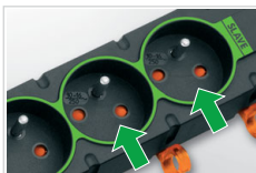
SURGE PROTECTION INDICATOR, AUTOMATIC FUSE, 2 INDEPENDENT SOCKET OUTLETS 10A WITH EARTHING PIN AND SAFETY SHUTTERS