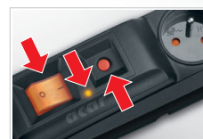
ILLUMINATED DOUBLE POLE MAINS SWITCH, SLOW-BLOW AUTOMATIC FUSE, SURGE PROTECTION INDICATOR