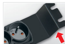
RACK MOUNT BRACKETS