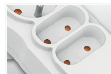
2 UNEARTHED EURO SOCKETS 2,5A WITH SAFETY SHUTTERS

The manufacturer reserves the right to change the technical parameters of the device, resulting from technological progress. ATTENTION! The technical data define the maximum values of surges against which the device protects.